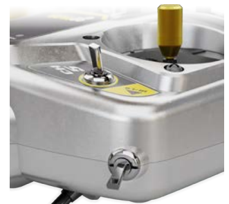
HI/LO Switch In the down position

This light indicates that the transmitter is sending a signal. It does not indicate connection to a receiver or movement of the gimbals.